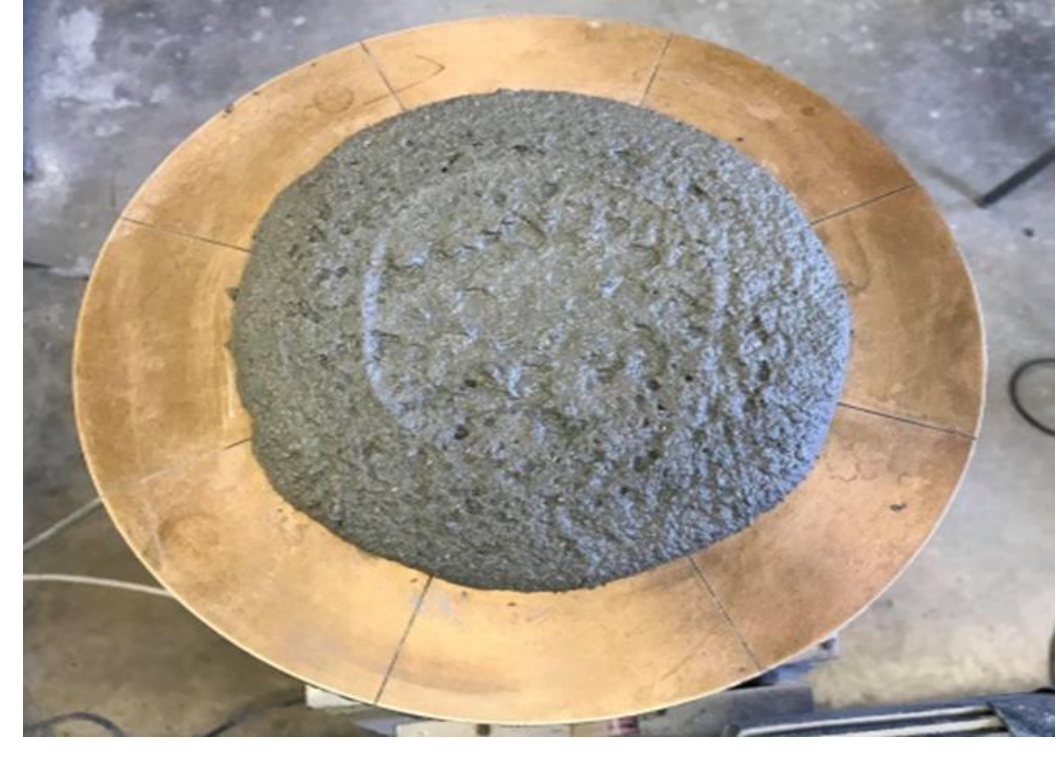
Fig. 5. Flow table value. Fig. 4. Flow table.

□ For measuring setting time, cementitious paste was made with w/cm ratio = 0.40. An automatic Vicat apparatus machine having 1 mm penetration needle was used with 10 mins of penetration interval to accomplish the test method B by ASTM C191-18a.