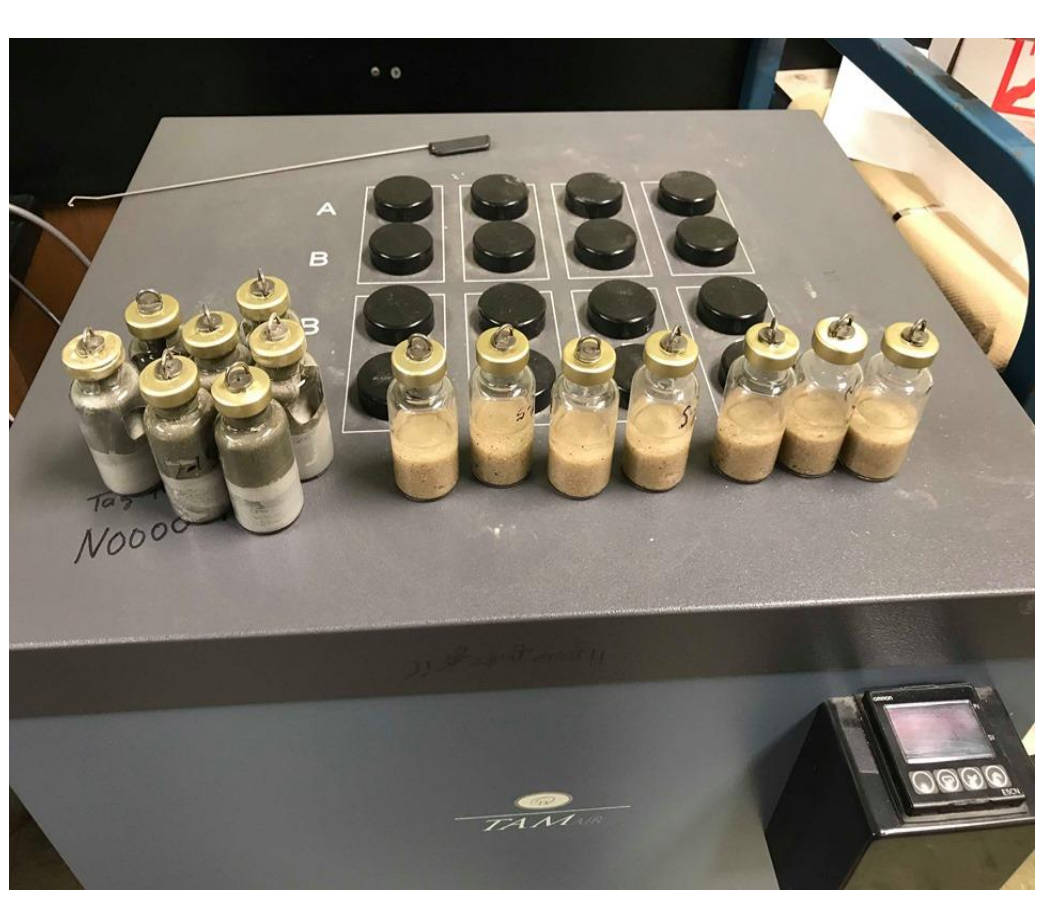
Fig. 9. Isothermal Calorimeter.