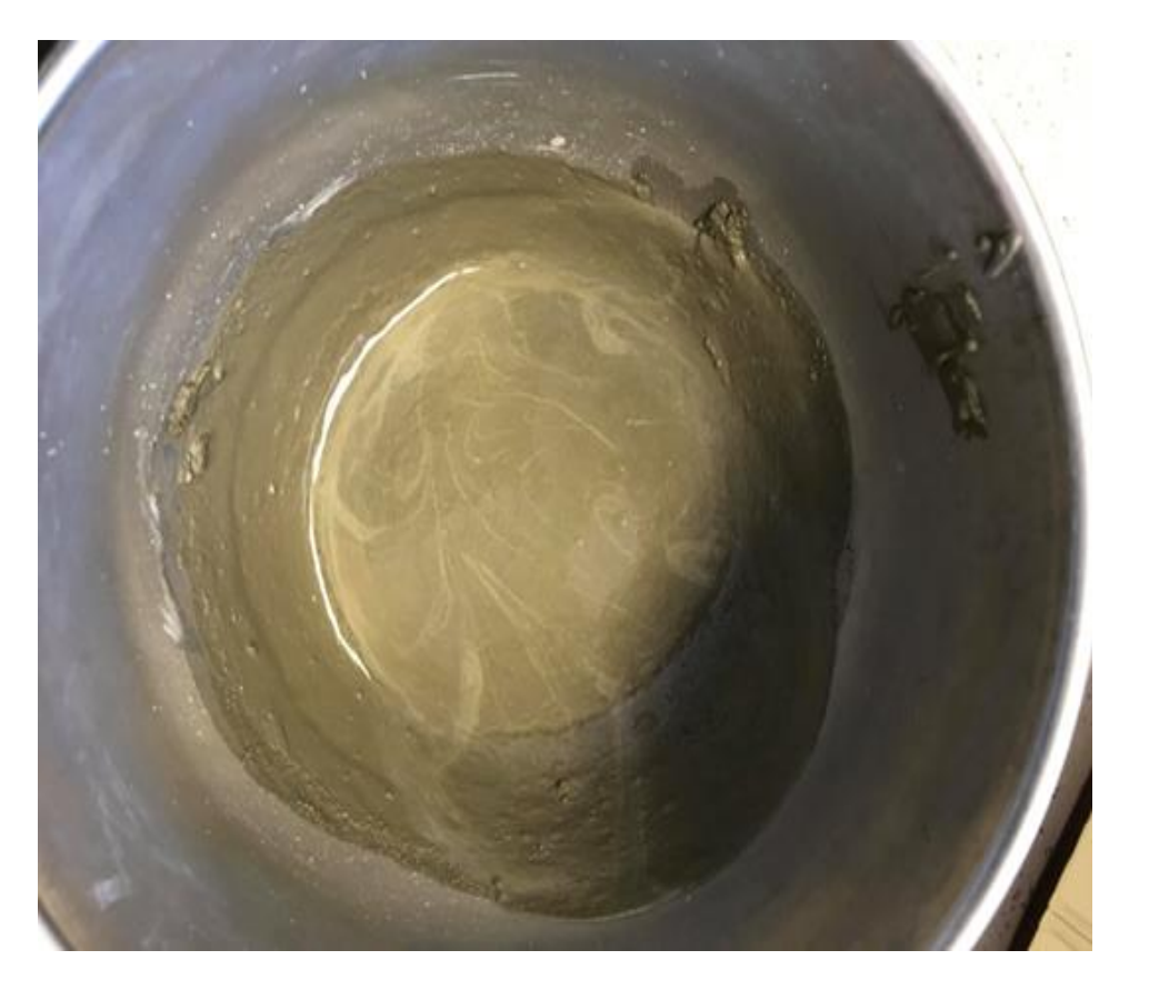
Fig. 8. Mixing paste.

□ Samples were prepared with w/cm ratio of 0.45 and placed in sealed glass vials for monitoring at least 72 hours at 25 °C in a TAM Air isothermal calorimeter. Heat of hydration calculations were done according to ASTM C1679-17.