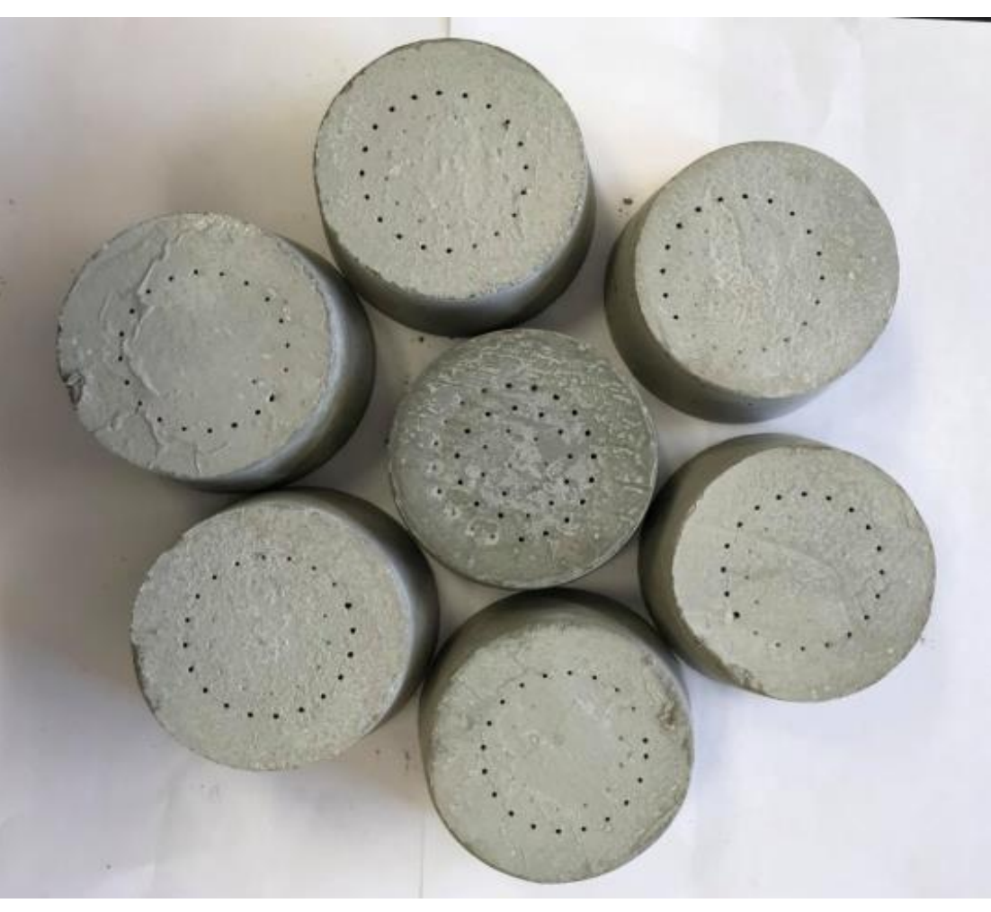
Fig. 6. Vicat apparatus. Fig. 7. Samples after testing.

□ Samples were prepared with w/cm ratio of 0.45 and placed in sealed glass vials for monitoring at least 72 hours at 25 °C in a TAM Air isothermal calorimeter. Heat of hydration calculations were done according to ASTM C1679-17.