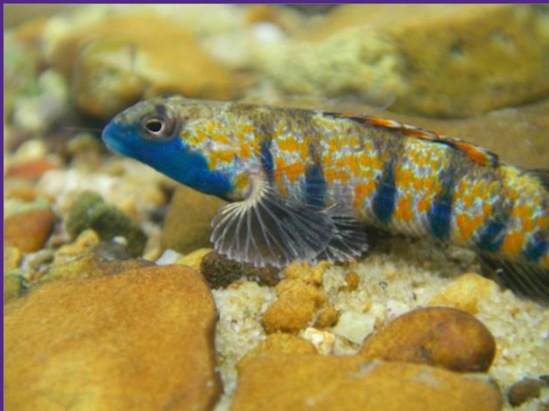
Figure 1 Bluemask Darter ( Etheostoma akatulo )

The ESS Capstone Education Group has worked diligently to find different methods to inform residents, both children and adults, on ways they might voluntarily (and involuntarily) negatively impact the area. Our ultimate goal is to encourage environmental stewardship that will result in improving the health and sustainability of the Calfkiller River.