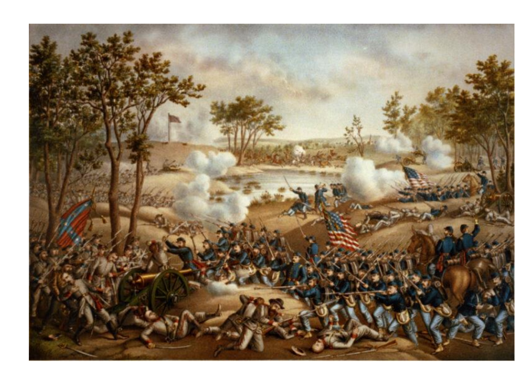
1888 Depiction of The Battle of Antietam Bill of Rights Institute

"You may even assure them promptly in that case that if they determine to recognize, they may at the same time prepare to entire into alliance with the enemies of this Republic."