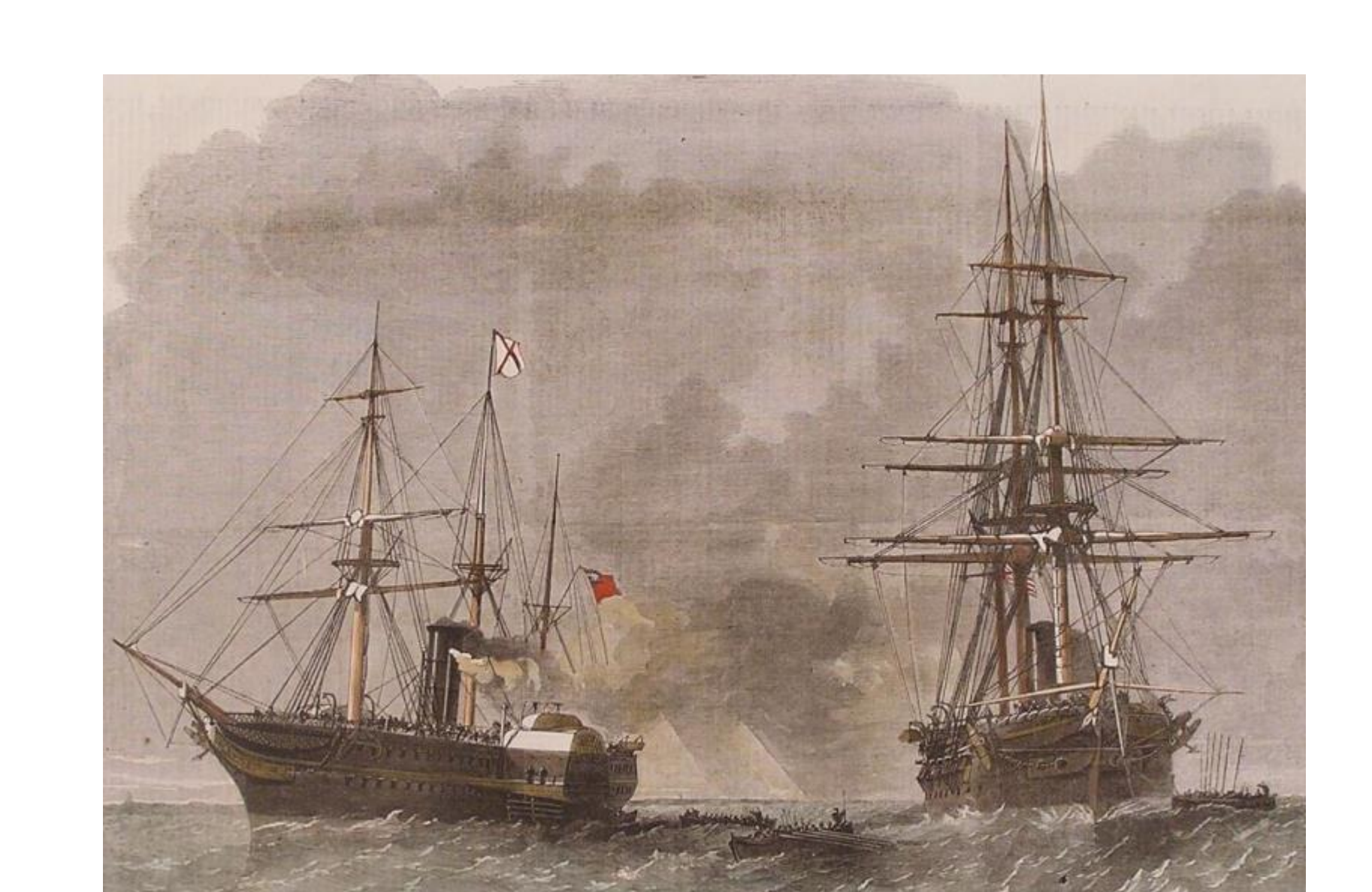
USS San Jacinto stops RMS Trent.